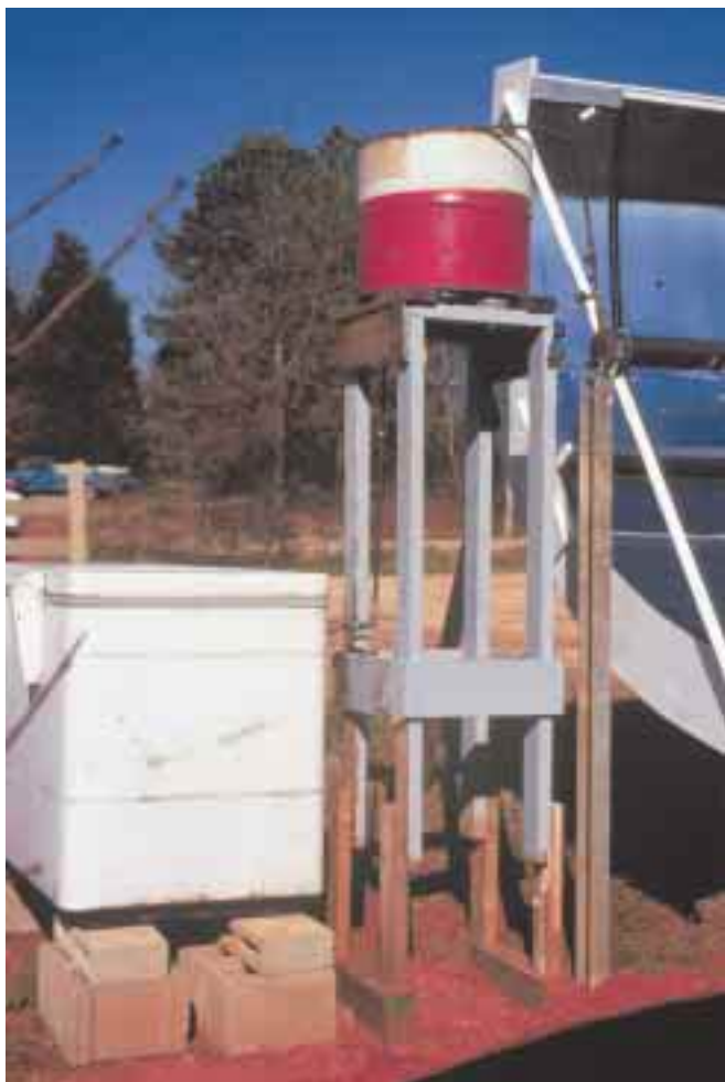
Above: Detail of the condenser bath, containing the condenser coil, and the icemaker box below.

The generator is a three-inch non-galvanized steel pipe positioned at the focus of a parabolic trough collector. The generator is oriented east-west, so that only seasonal and not daily tracking of the collector is required. During construction, calcium chloride is placed in the generator, which is then capped closed. Pure (anhydrous) ammonia obtained in a pressurized tank is allowed to evaporate through a valve into the generator and is absorbed by the salt molecules, forming a calcium chloride-ammonia solution ( \text{CaCl}_2 \cdot 8\text{NH}_3 ).