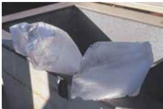
Above: About ten pounds of ice are created in one cycle of ammonia evaporation / condensation.

As the generator cools, the night cycle begins. The calcium chloride reabsorbs ammonia gas, pulling it back through the condenser coil as it evaporates out of the tank in the insulated box. The evaporation of the ammonia removes large quantities of heat from the collector tank and the water surrounding it. How much heat a given refrigerant will absorb depends on its "heat of vaporization," — the amount of energy required to evaporate a certain amount of that refrigerant. Few